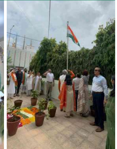
15th Aug Independence day celebration with Team PCAPL