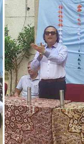
Independence Day Celebration at Arpan Charitable Trust