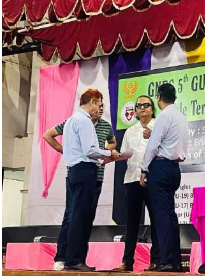
Independence Day Celebration at Balgokulam